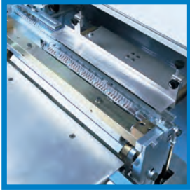
The wire setting in the magnetic arm.

The Company reserves itself the right to modify the features of the products shown in this catalogue.